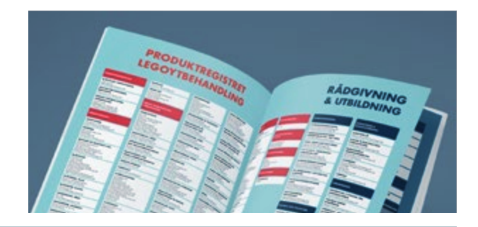
e I, tal v mm 18 EK 7